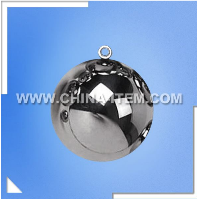
50 mm Test Steel Ball with Ring